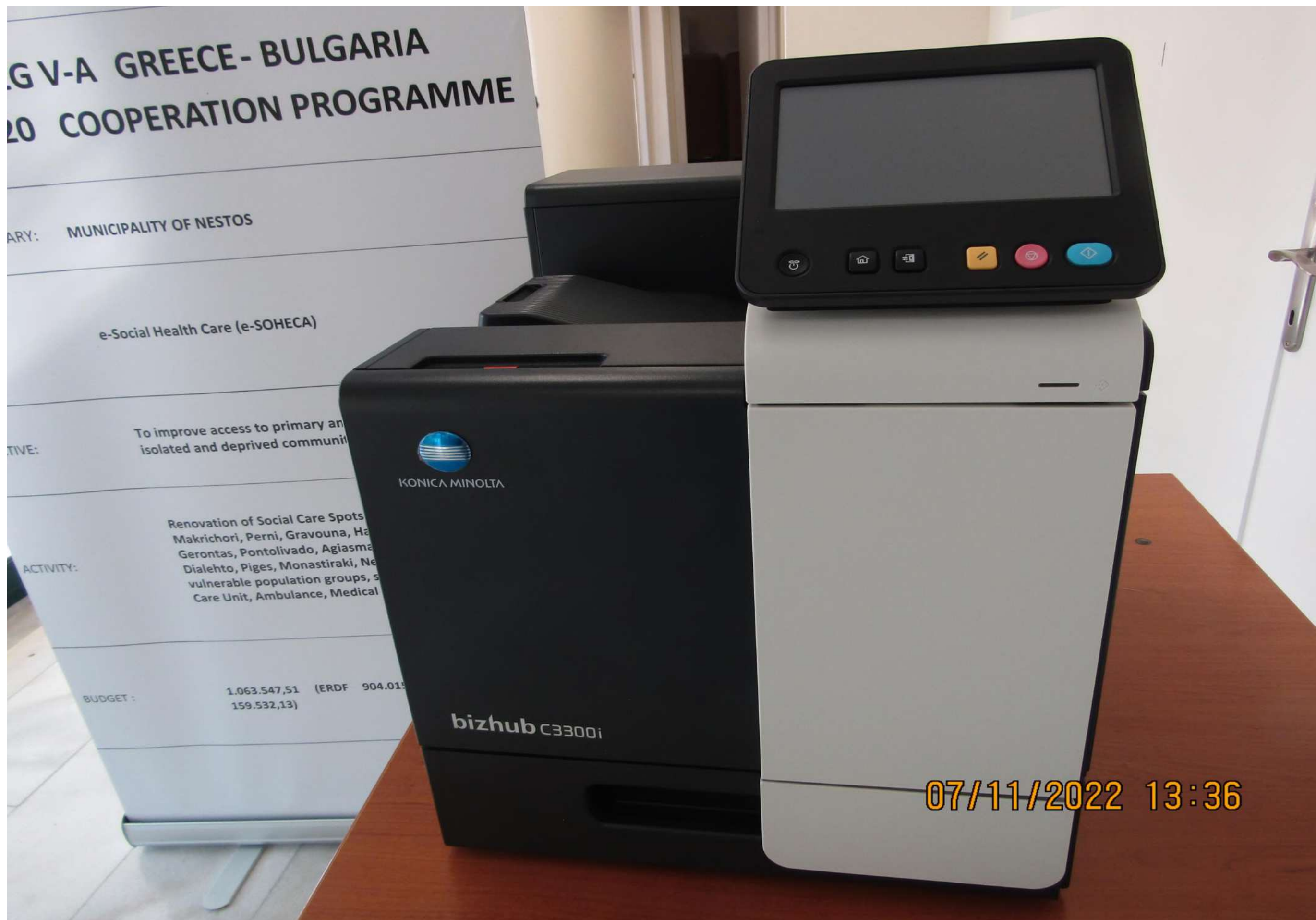
Picture 9: Multifunction printing machine (5) Serial number AAJT021208895