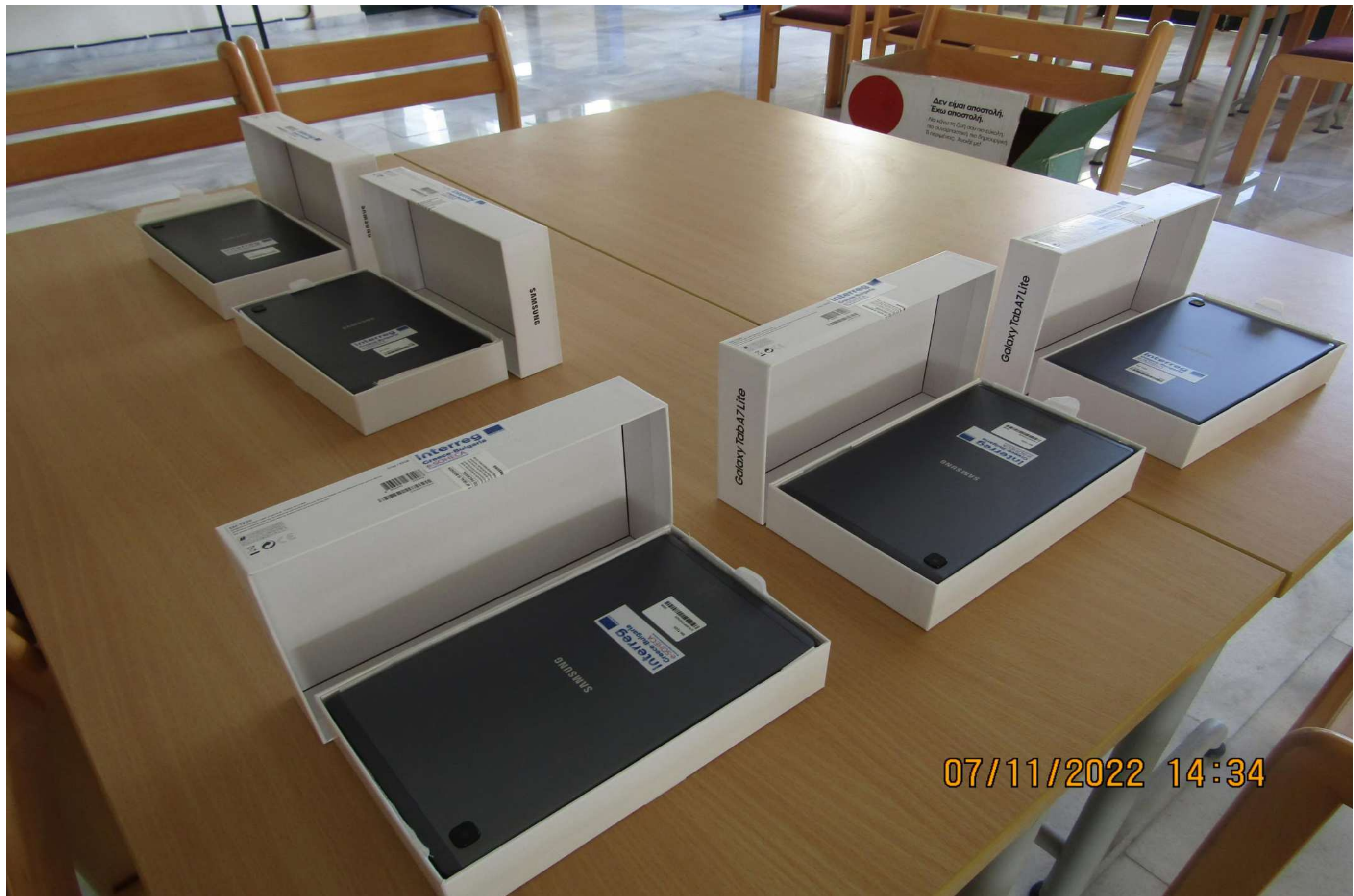
Picture 31: Tablets (5 Items) Serial number R9PT710TAWN, R9PT710V00B, R9PT710TJNL, R9PT710TEZF, R9PT710TA5X