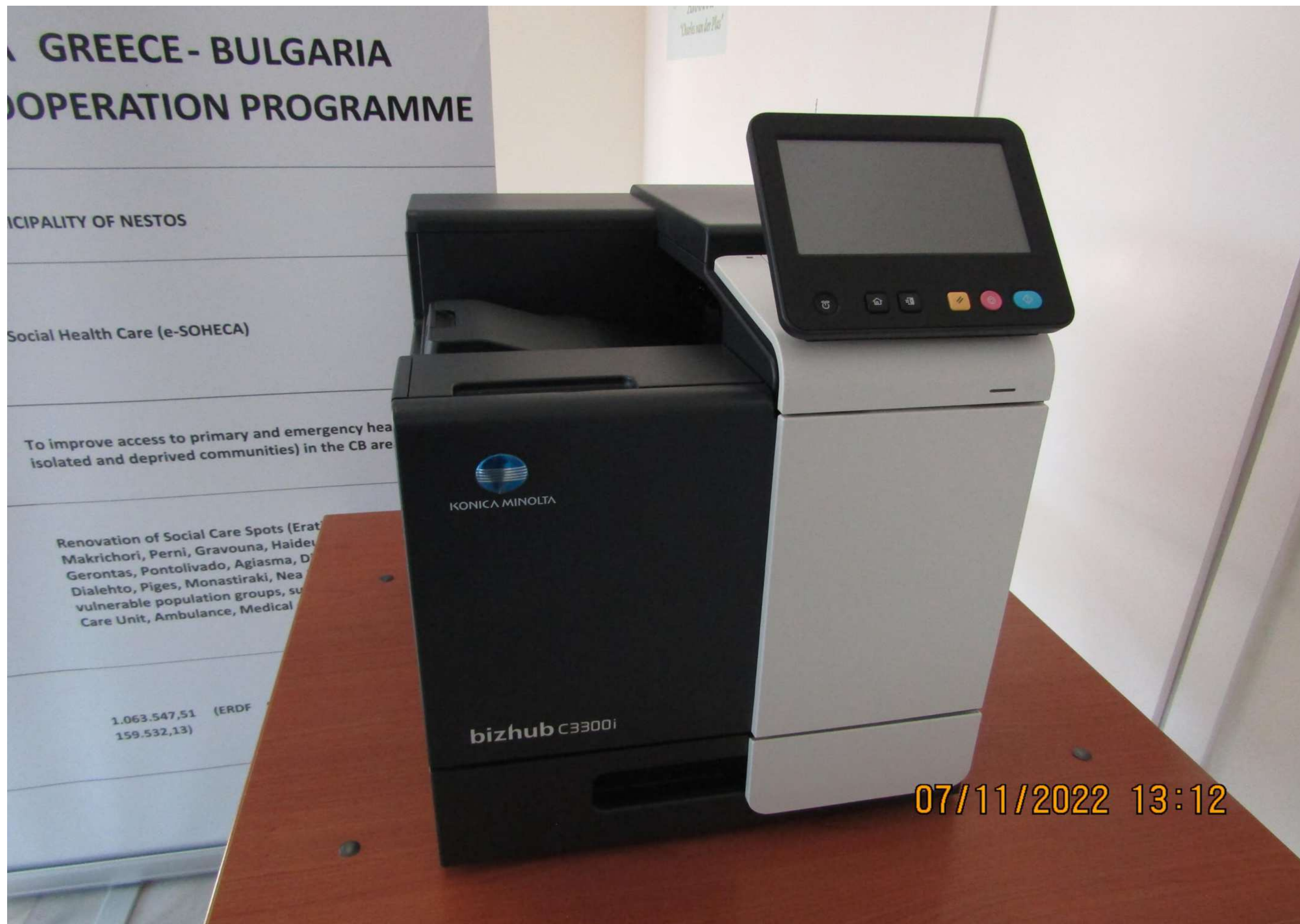
Picture 1: Multifunction printing machine (1) Serial number AAJT021208911