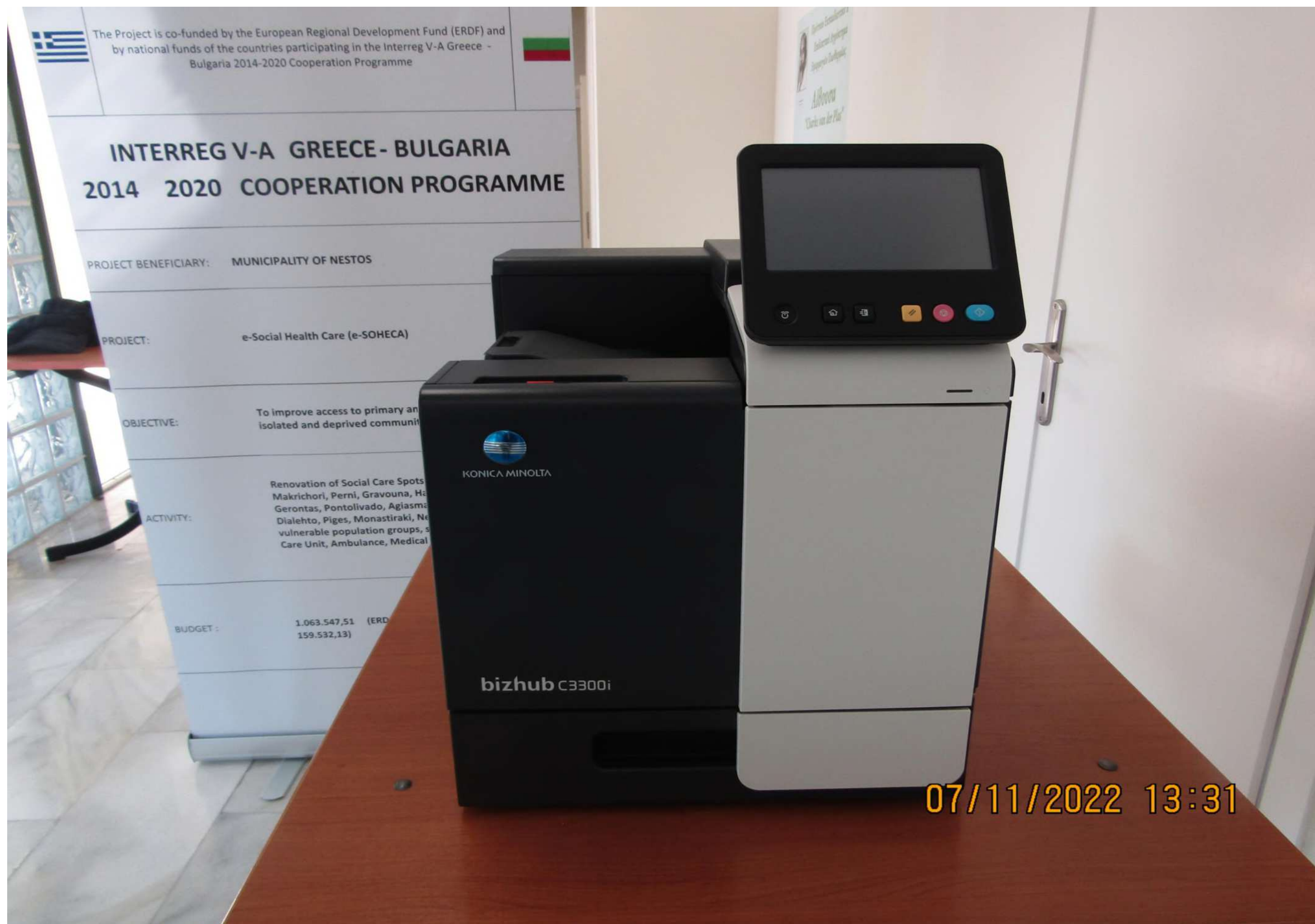
Picture 7: Multifunction printing machine (4) Serial number AAJT021208894