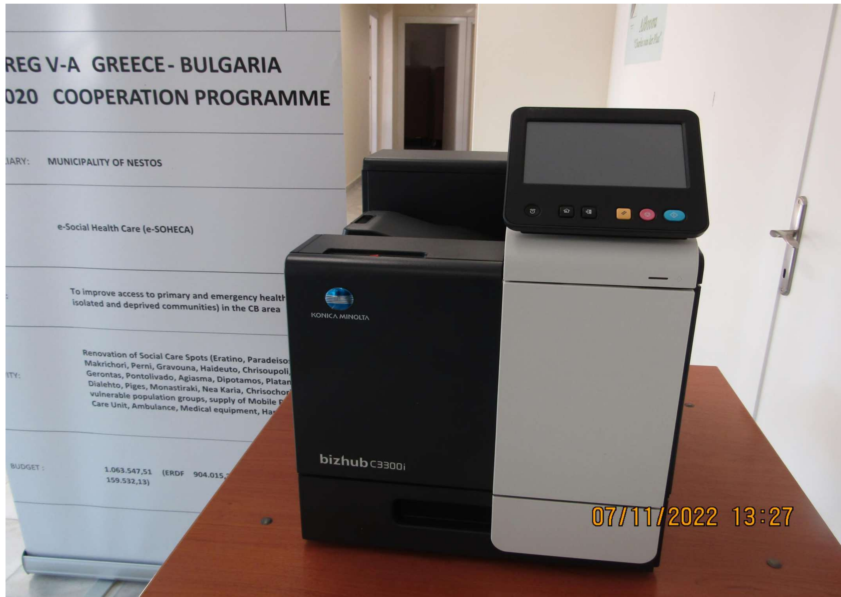
Picture 5: Multifunction printing machine (3) Serial number AAJT021208818