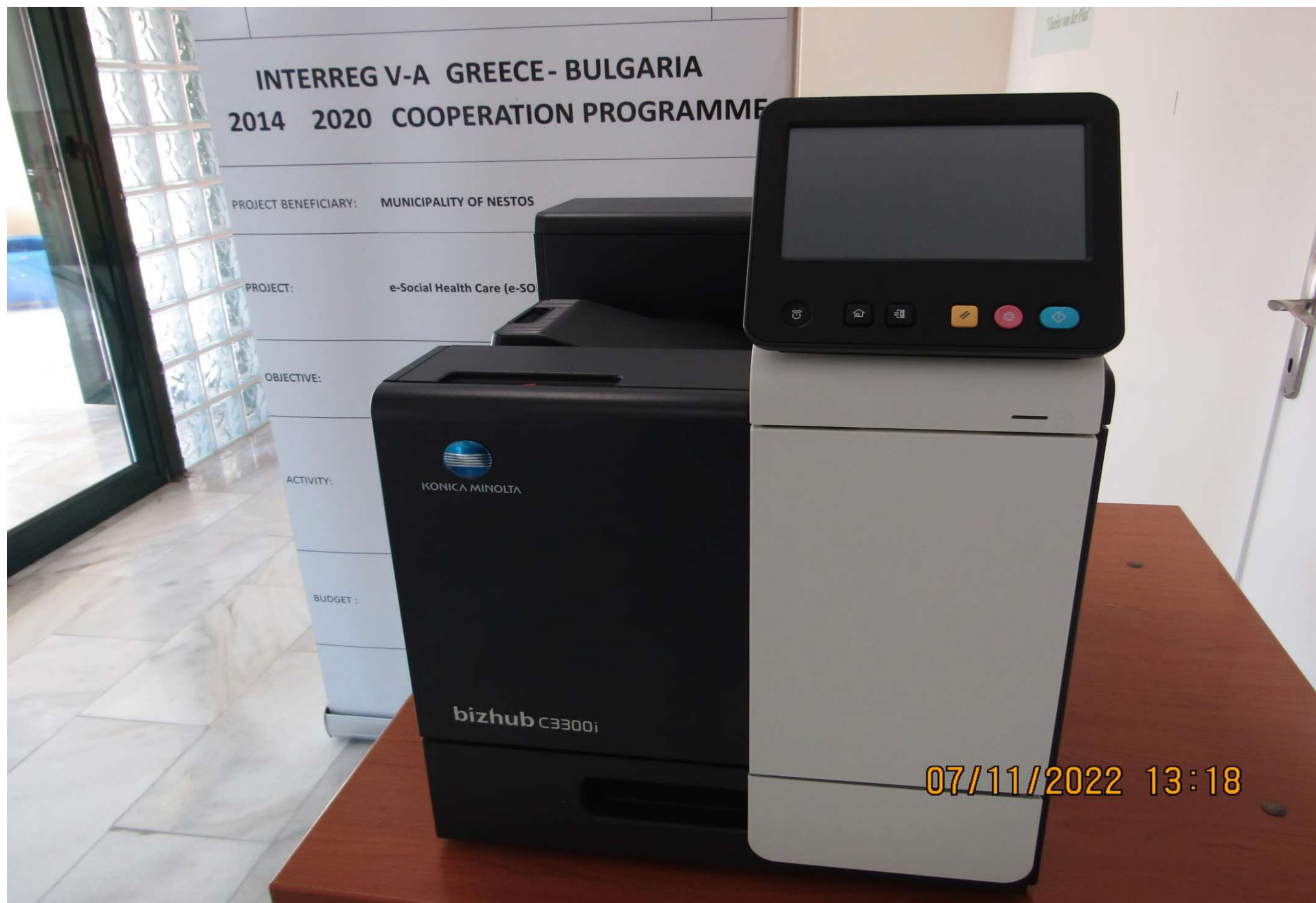
Picture 3: Multifunction printing machine (2) Serial number AAJT021208826